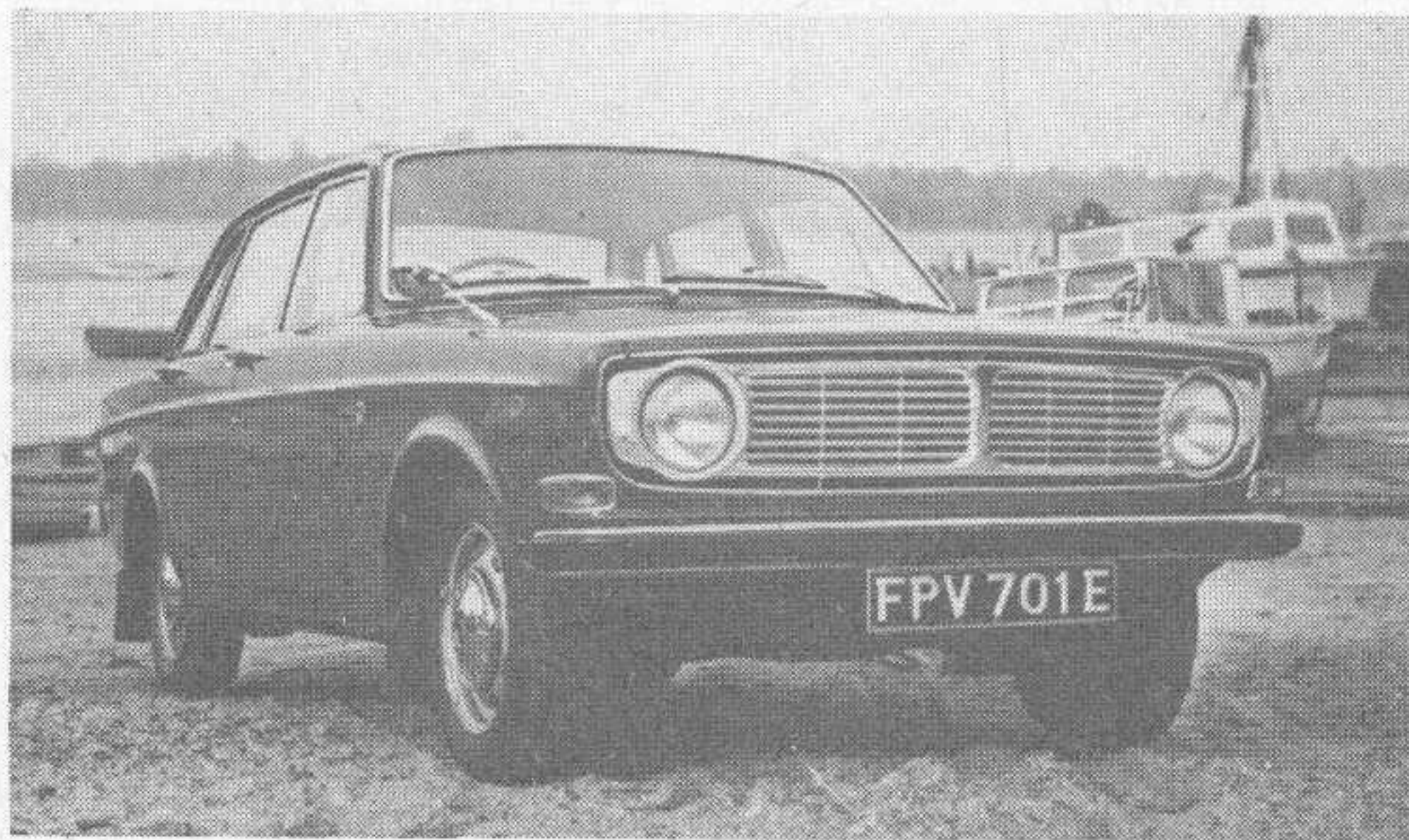
The original 140-series cars had a full-width grille and small, separate indicator lamps at the front

August 1970 saw the second major change in the 140-series history. The carburettor cars became known as De Luxe; the wheelbase was extended by 0.5in., to 8ft 7in., and wider-rimmed wheels were fitted, going up from 4.5 to 5in. At the same time, overdrive was dropped as an option. Until now, all Volvos had had carburettors, but with the introduction of the GL, in manual and automatic forms, came Bosch electronic petrol injection. The GL specification included leather upholstery and a sliding steel sunroof. Initially only