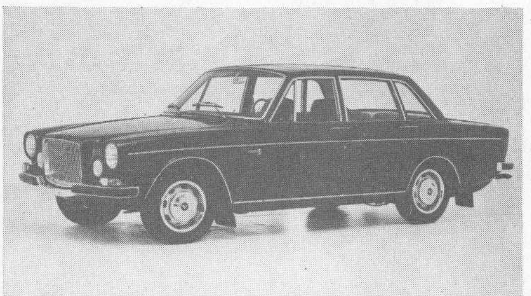
It was not long after the introduction of the 164 that a pair of fog lamps replaced the additional air intakes either side of the radiator grille