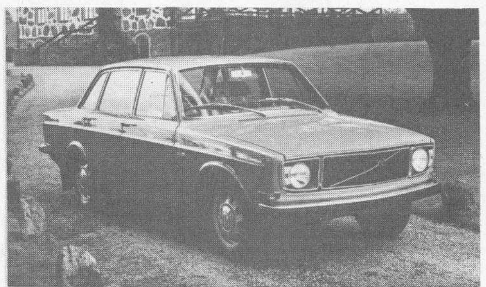
Later cars can be distinguished by the diagonal bar across the narrower grille; head restraints were standard on the front seats