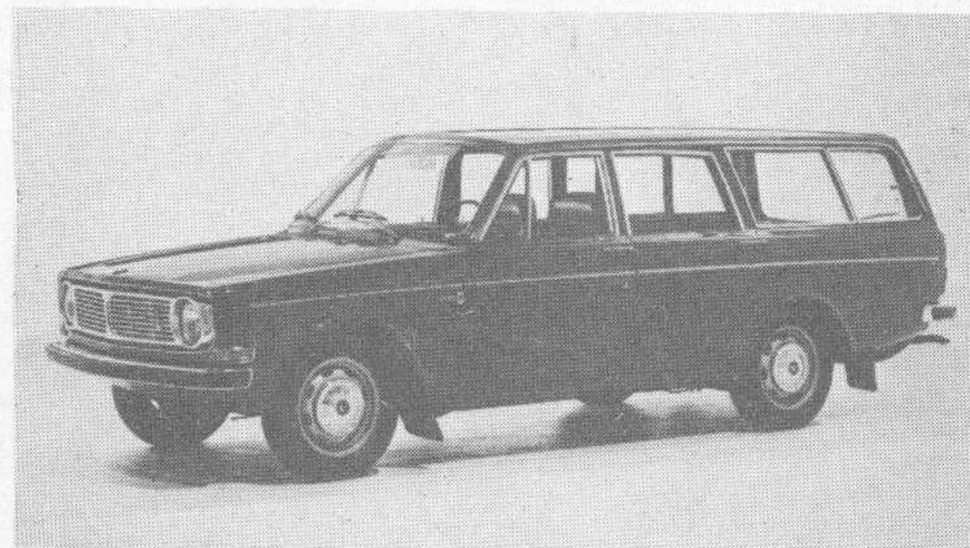
Early 145 estate cars had opening rear quarter vents, but no built-in through flow ventilation panels; these are beneath the rear window on later cars